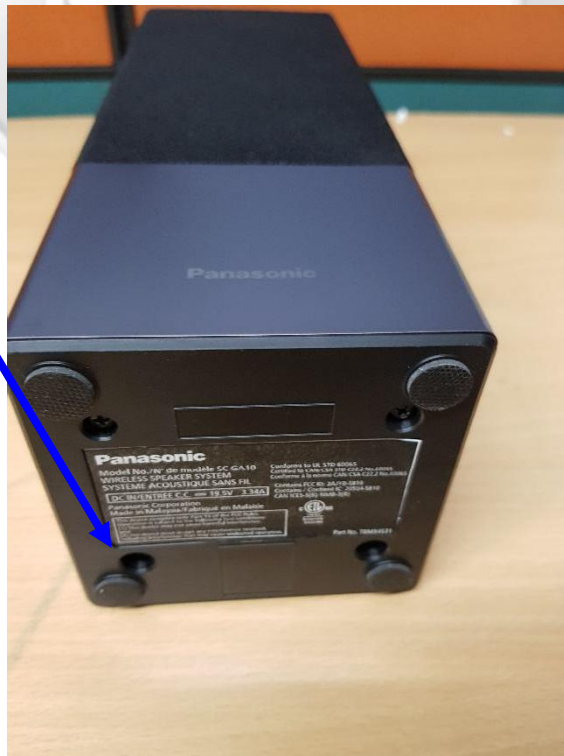
Physical Location of FCC Label on EUT