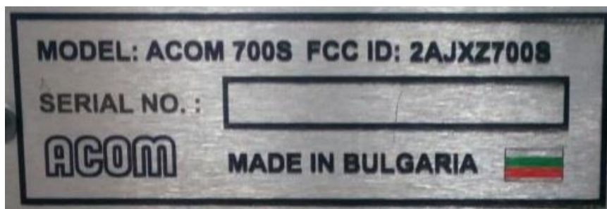
Fig.3 The label printed

In the FCC ID: 2AJXZ700S Grantee Code is 2AJXZ and the 700S portion is the equipment product code.