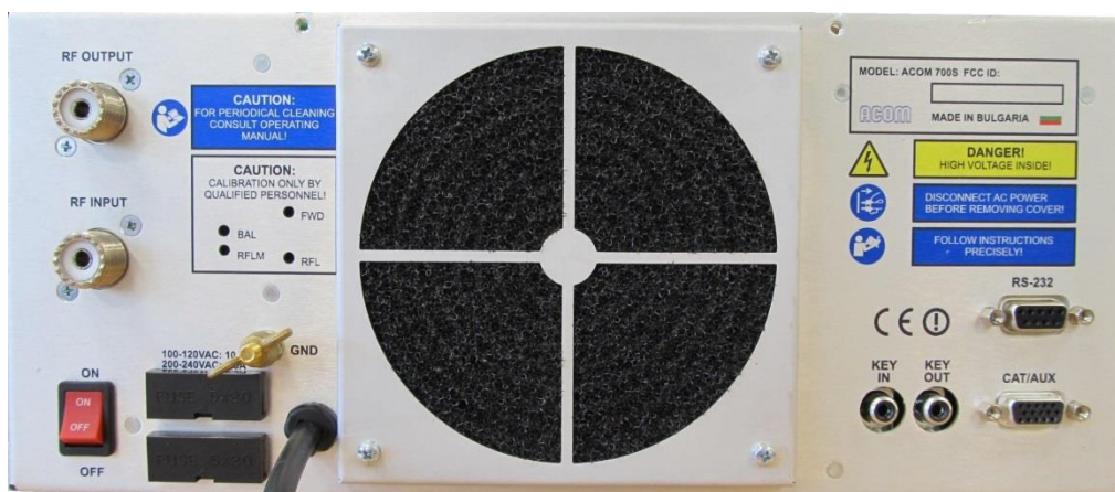
Fig.1 Label location