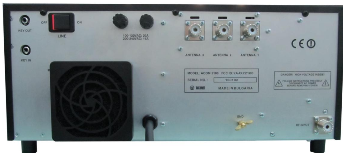
Fig.1 Label location