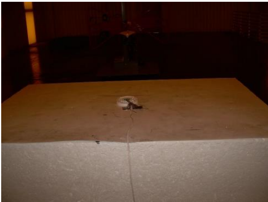
Photograph 2: Back View Radiated Emissions Worst Case 30 MHz to 1000 Configuration