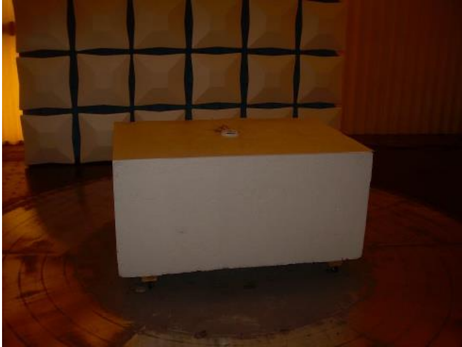
Photograph 1: Front View Radiated Emissions, Worst Case – Below 1000 MHz Configuration