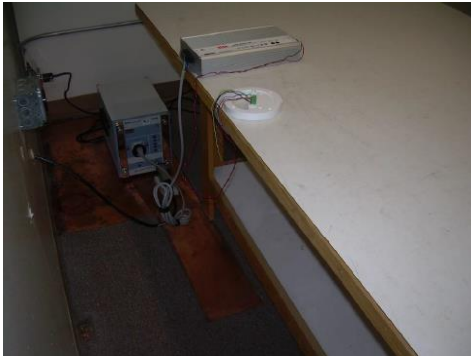
Photograph 6: Back View Conducted Emissions Worst-Case Configuration