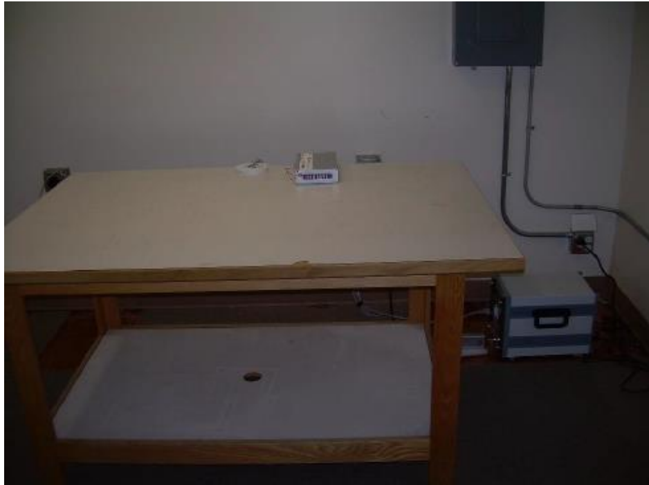
Photograph 5: Front View Conducted Emissions Worst-Case Configuration