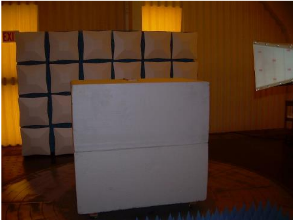
Photograph 3: Front View Radiated Emissions Worst Case – Above 1000 MHz Configuration