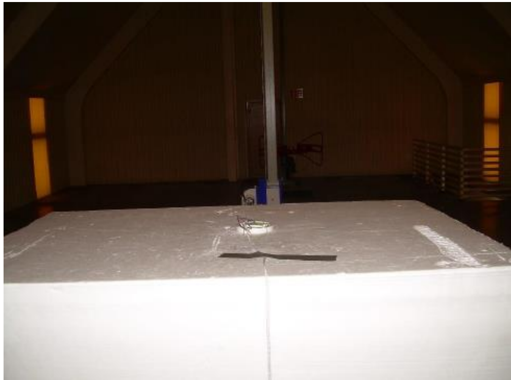
Photograph 4: Back View Radiated Emissions Worst Case – Above 1000 MHz Configuration