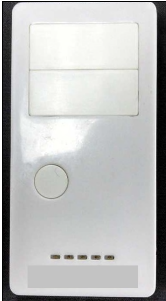
Figure 4: Models QAD-433, QFD-433 - Front