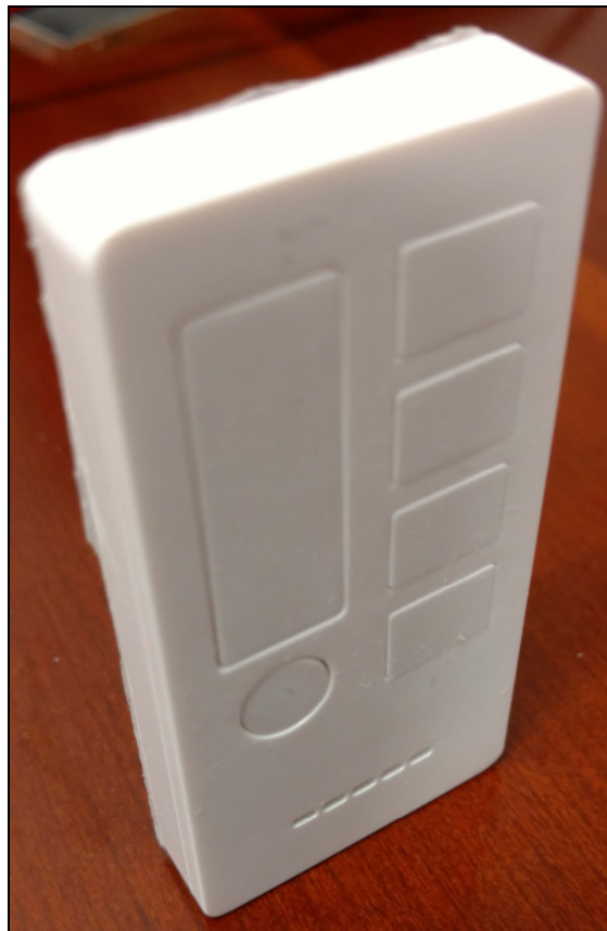
Figure 2: Side