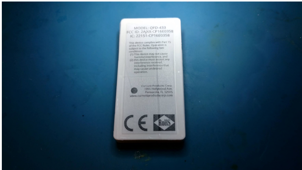
Figure 1: Back