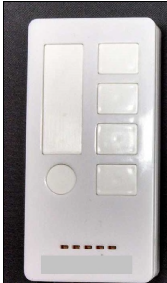
Figure 5: Models QAR-433, QFR-433, QAVMO-433, QFVMO-433, QATRA-433, QFTRA-433 - Front Models QAVMO-433, QFVMO-433, QATRA-433, QFTRA-433 are for ISED Canada only