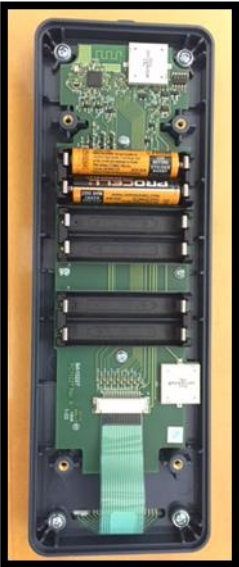
Keypad - Opened Back