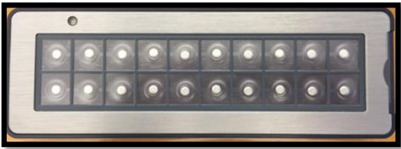
Keypad - Front