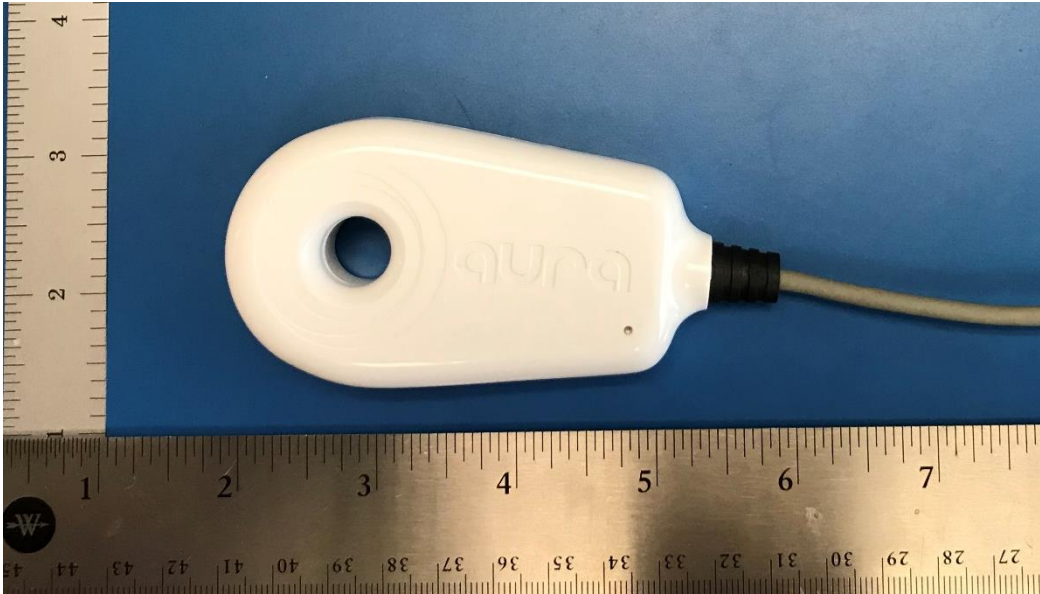
Figure 1 - AURA Monitor Antenna Exterior Top

The following photos show the exterior of the AURA™ Monitor Antenna host device. No label is shown in these pictures. Refer to the label image and the label location document for details and placement information.