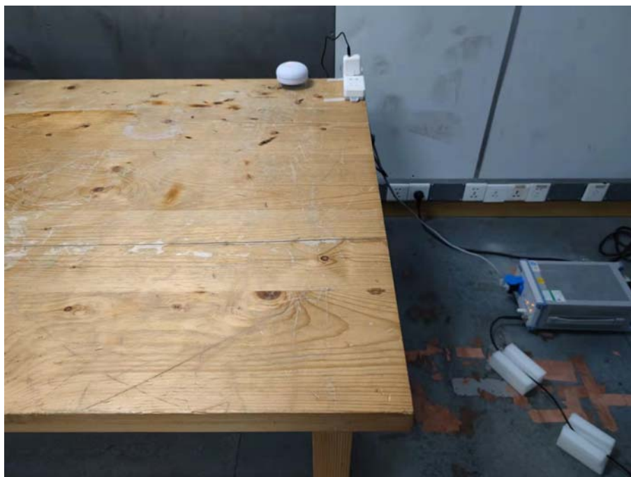
Photo of Power Line Conducted Emission Measurement