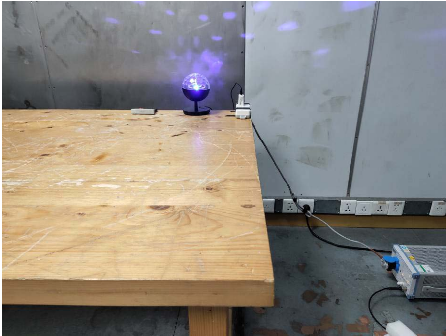
Photo of Power Line Conducted Emission Measurement