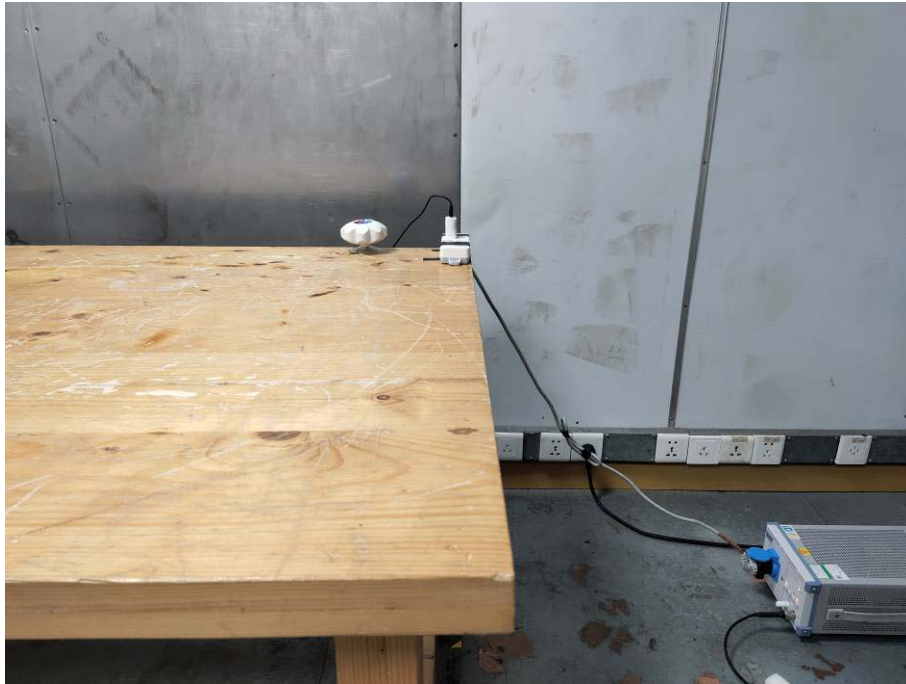
Photo of Power Line Conducted Emission Measurement