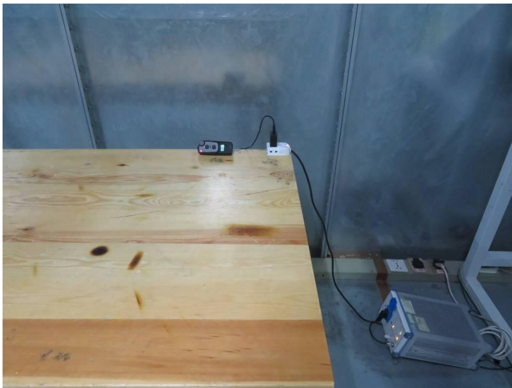
AC Conducted Emission of charge from power adapter