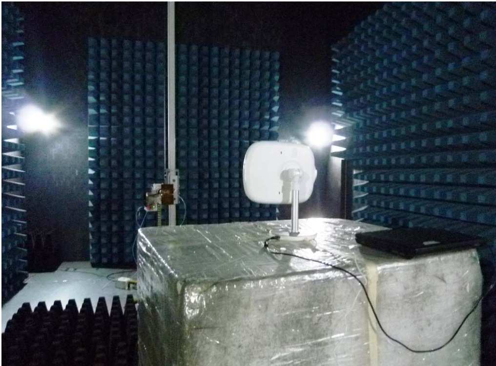
Radiated Emission Set up Photos (Front View)