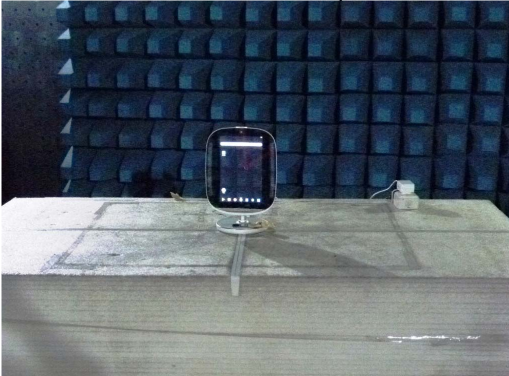
Front View of test setup

Unless otherwise stated the results shown in this test report refer only to the sample(s) tested and such sample(s) are retained for 90 days only.