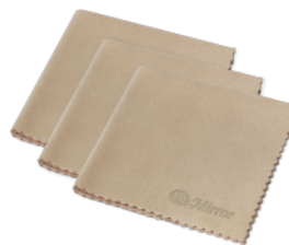
HiMirror microfiber cleaning cloth