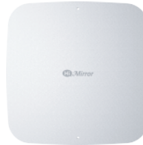
Smart Scale Metal Plate