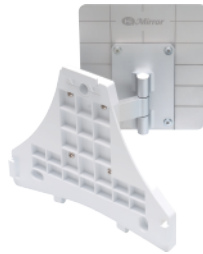
HiMirror Hinge Mount