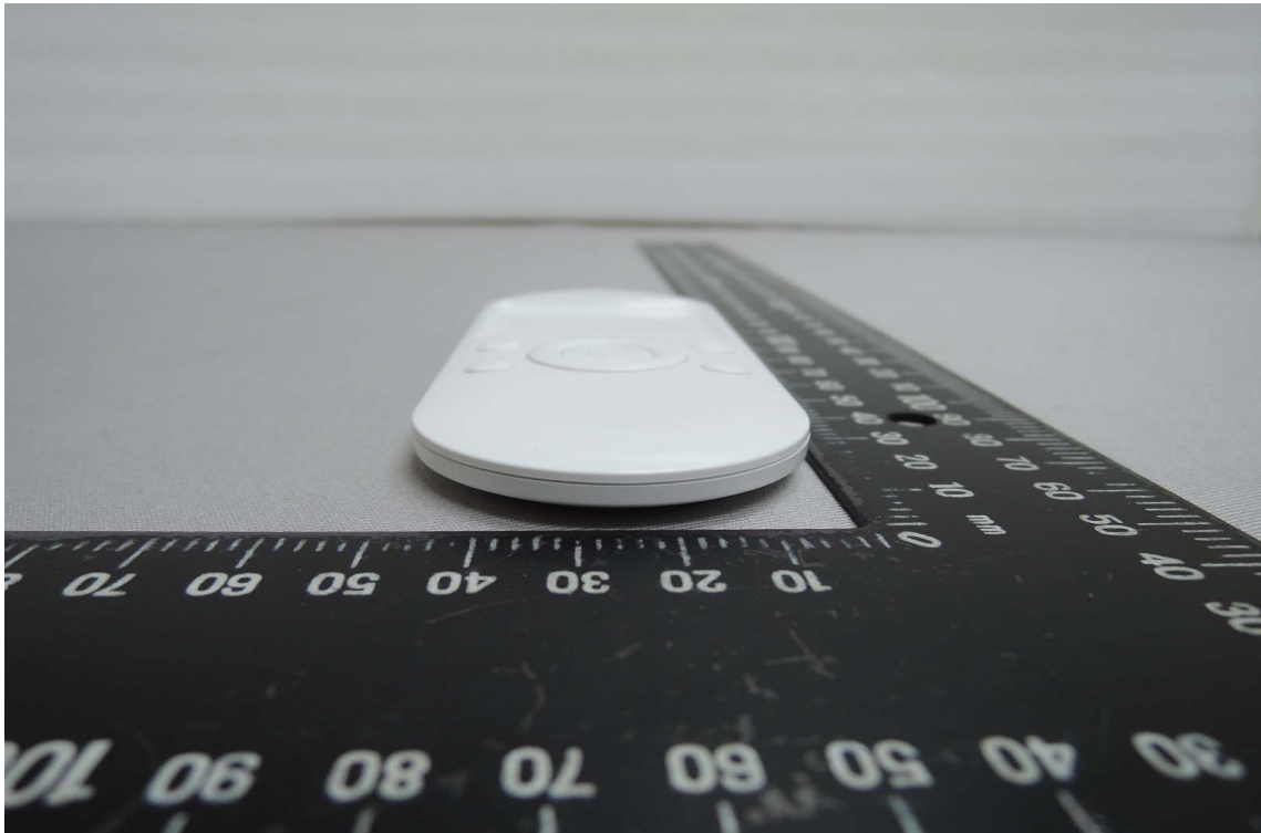
Side View of EUT - 2