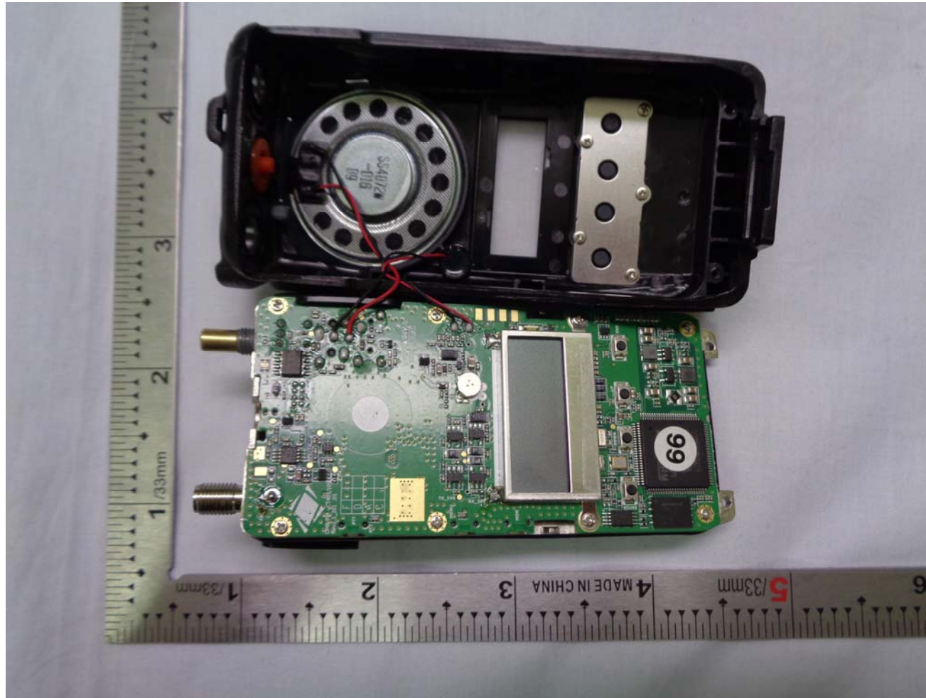
[ Inside View ]