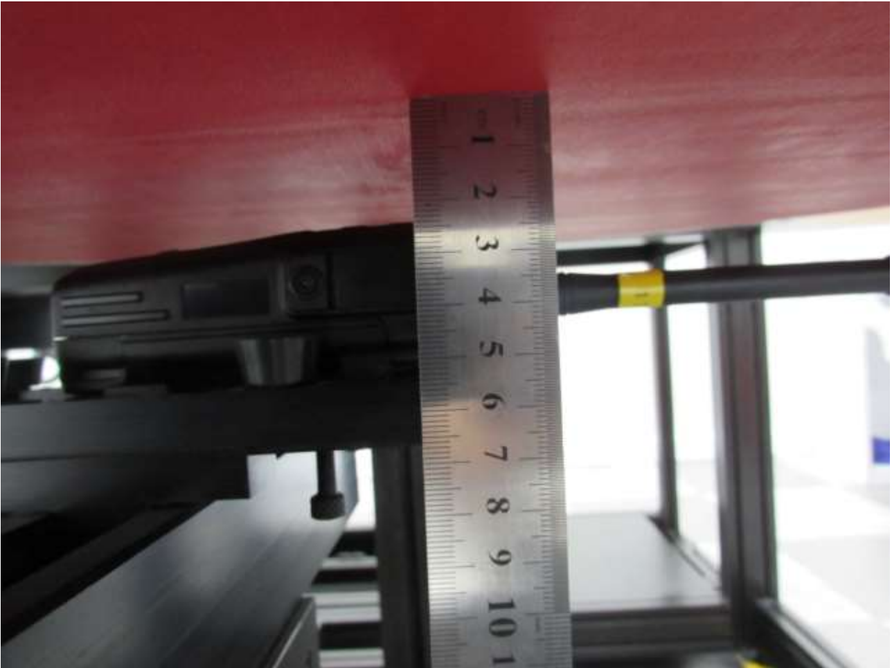
[Distance of 25 mm from the EUT]