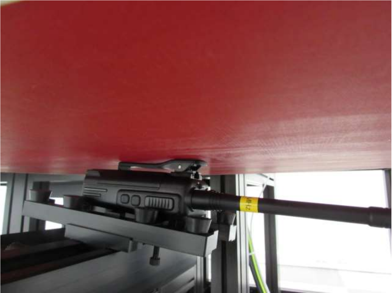
[Distance of 0 mm from the EUT]