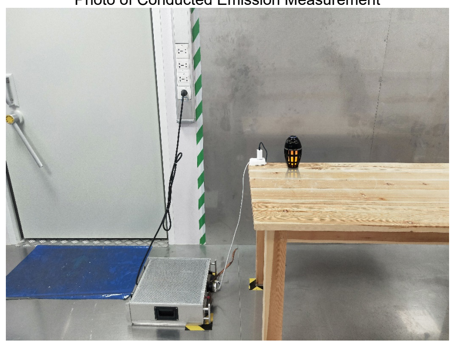
FCC: 2AJQ7TIKI Photo of Conducted Emission Measurement