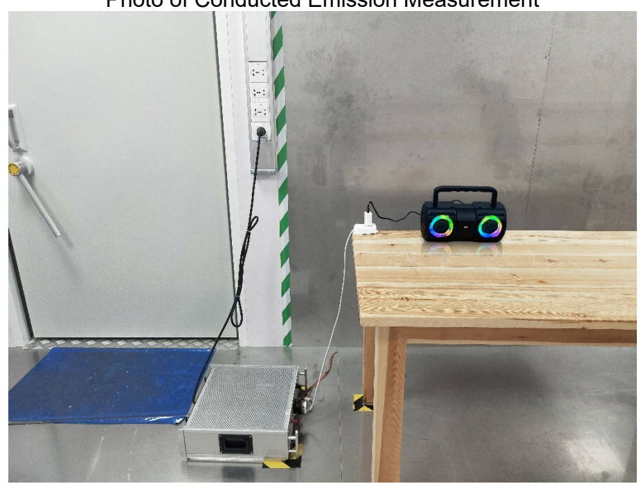
FCC: 2AJQ7BOOMX Photo of Conducted Emission Measurement