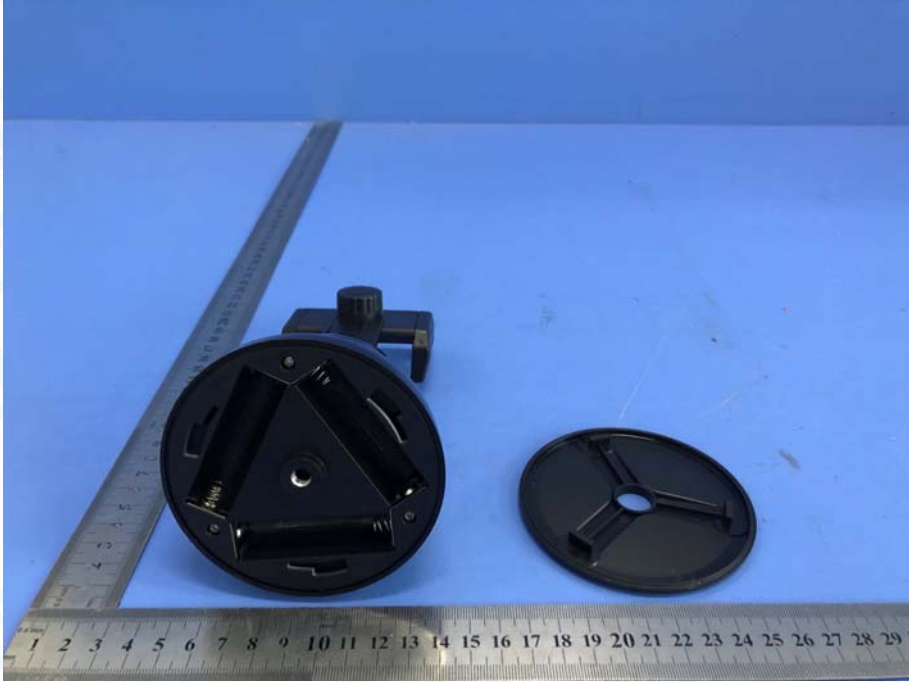
Photo 7 Internal of EUT