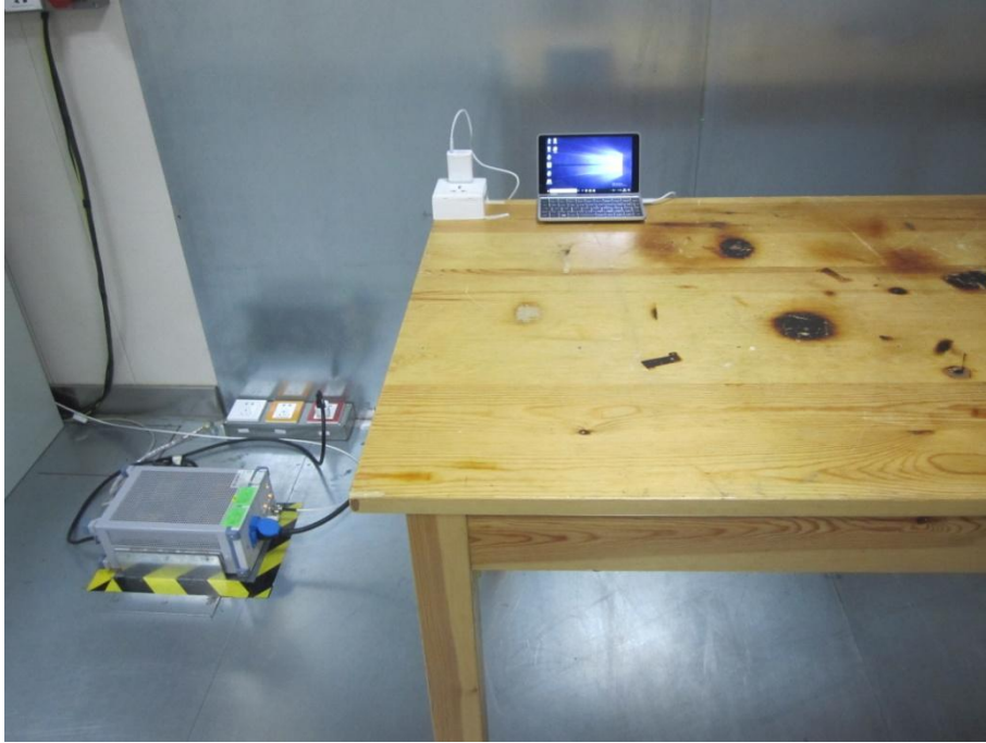
DTS radiation L