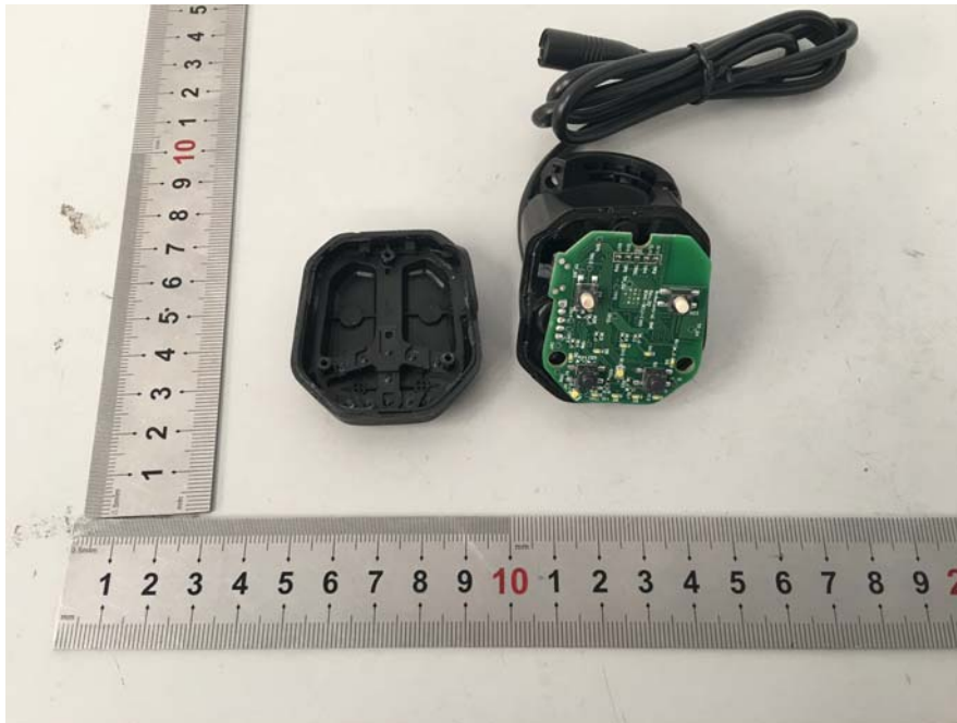
EUT – PCB Top View