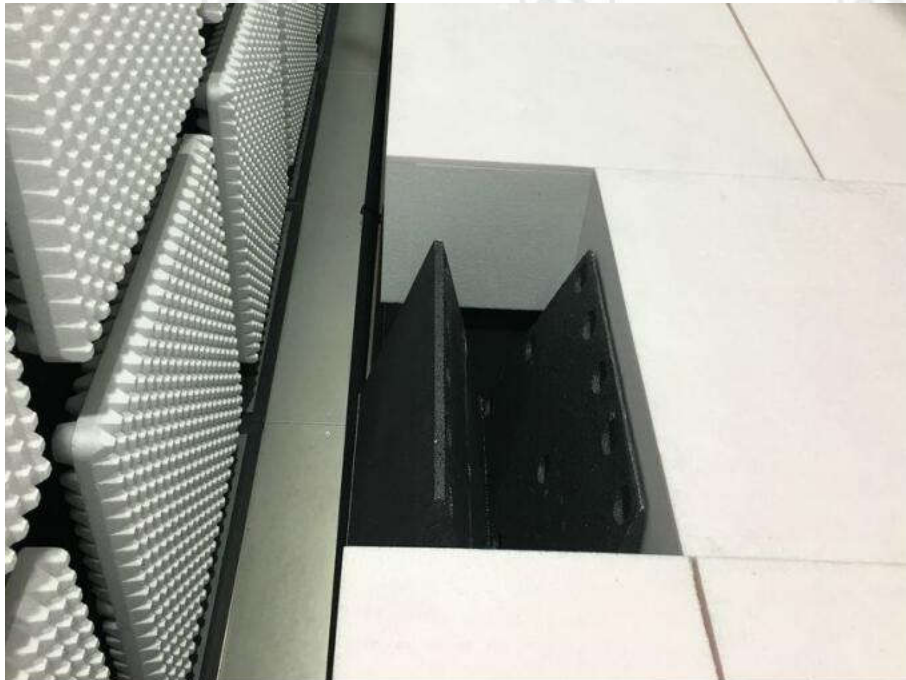
Radiated spurious emission Test Setup-4(Above 1GHz) There are absorbing materials under the ground.