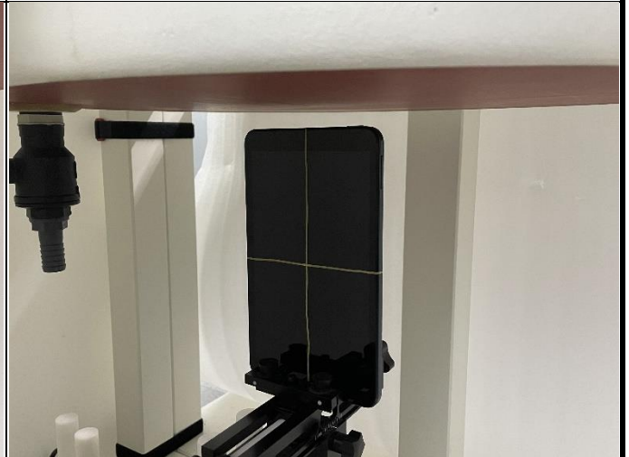
Top Side of EUT with 1.5 cm Gap