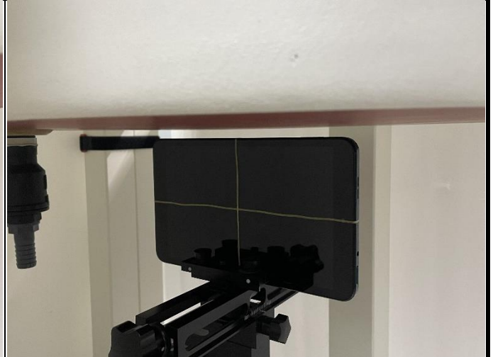
Left Side of EUT with 0.7 cm Gap