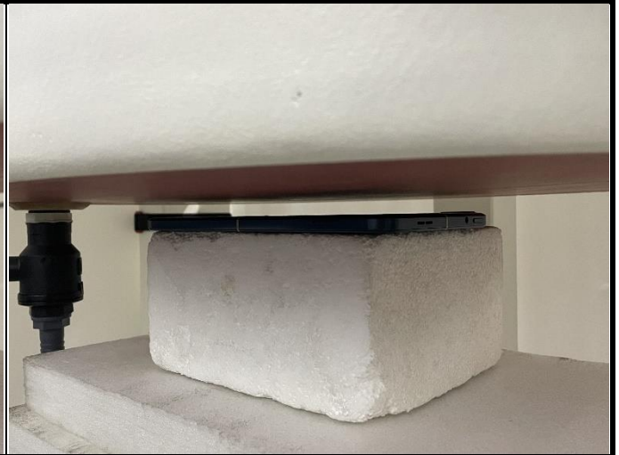
Rear Face of EUT with 1.3 cm Gap