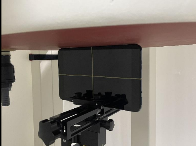
Left Side of EUT with 0 cm Gap