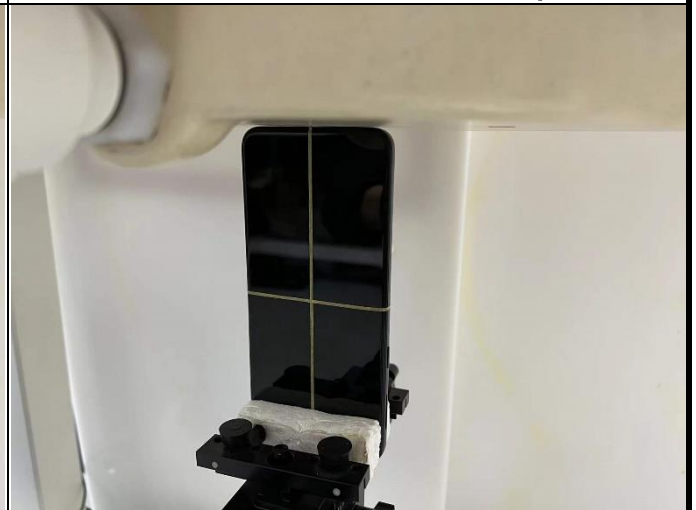
Bottom Side of EUT with 0 cm Gap