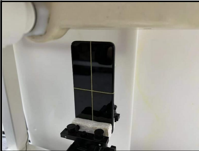
Bottom Side of EUT with 2.0 cm Gap