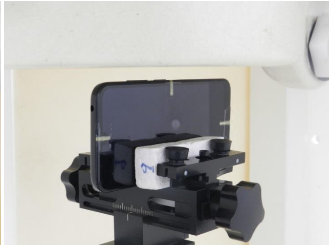
Right Side, Test Separation 10 mm