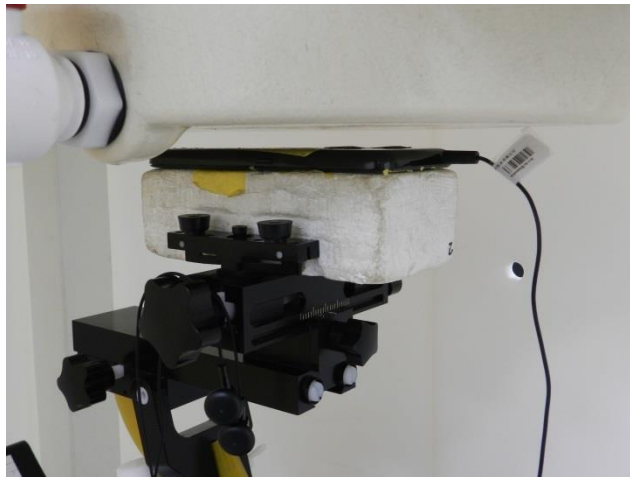
Back with headset, Test Separation 10 mm