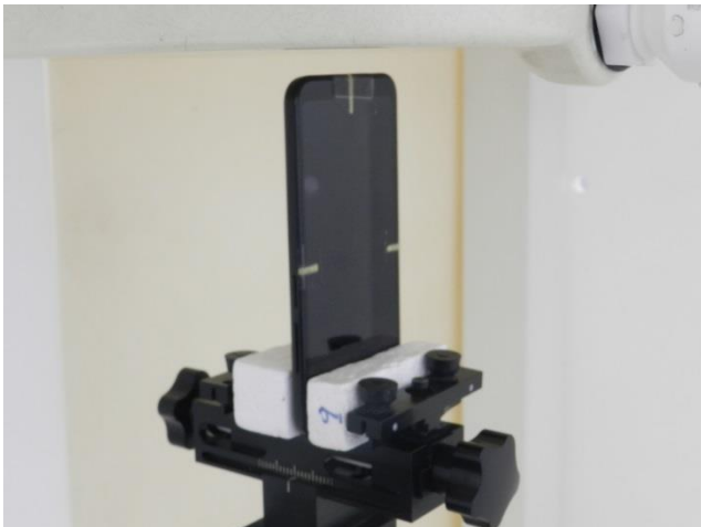
Bottom Side, Test Separation 10 mm