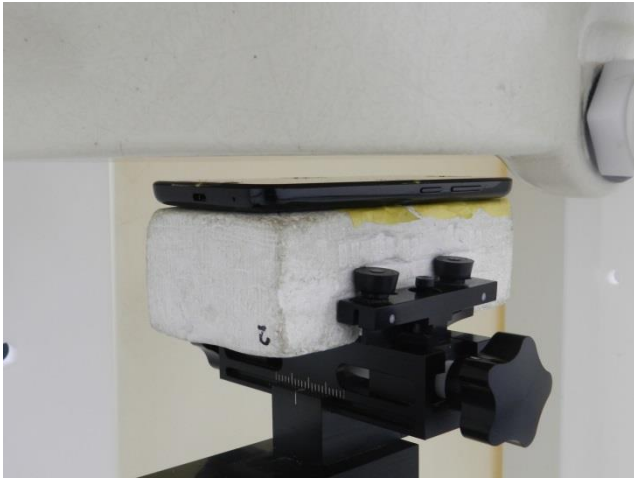
Front, Test Separation 10 mm