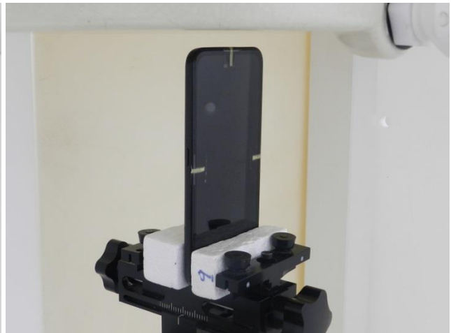
Top Side, Test Separation 10 mm