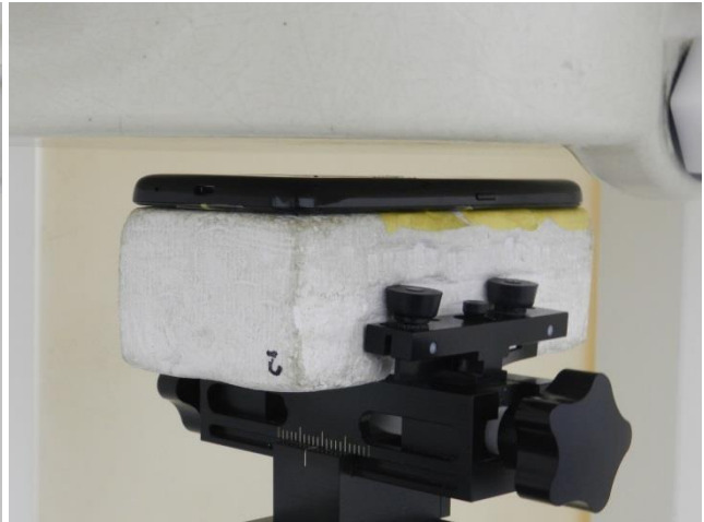
Back, Test Separation 10 mm