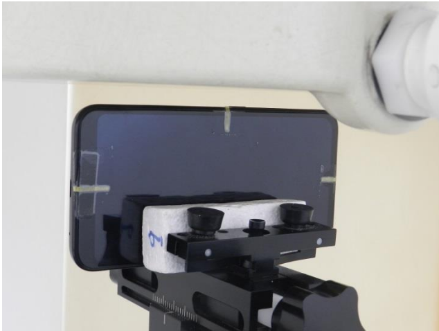
Left Side, Test Separation 10 mm