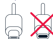
USB micro-B USB-C

To switch your phone on, press and hold the power key until the phone vibrates. The phone guides you through the setup.