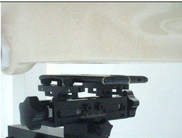
Rear Face of EUT with 1.5 cm Gap