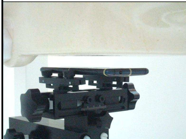
Front Face of EUT with 1.5 cm Gap