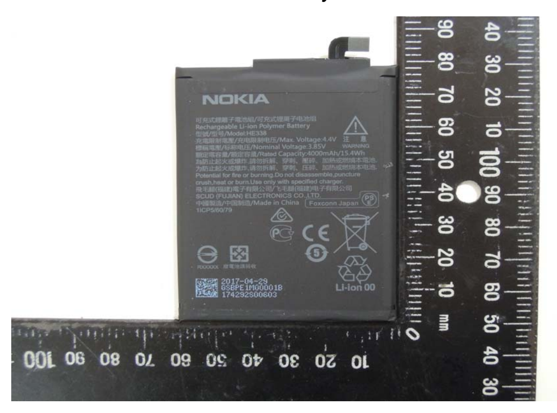
Open View of EUT-1