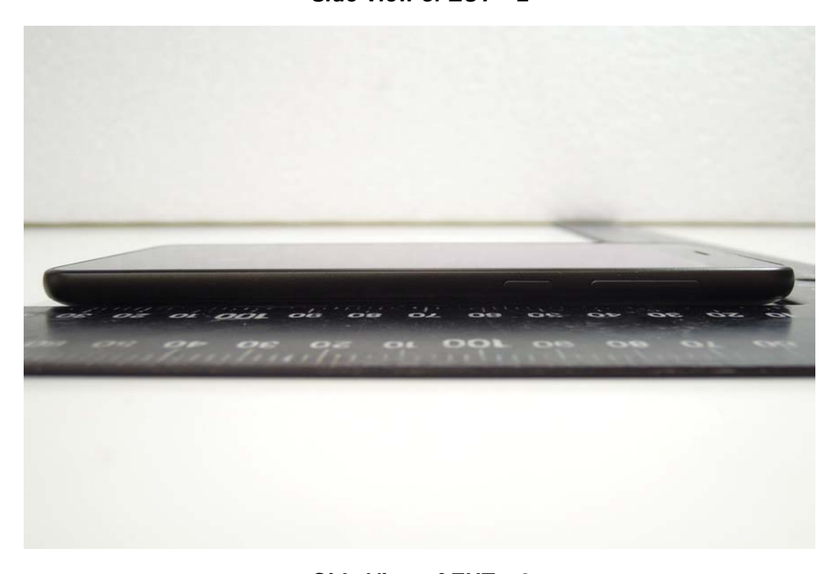
Side View of EUT - 3