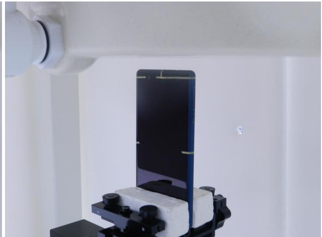
Top Side, Test Separation 10 mm