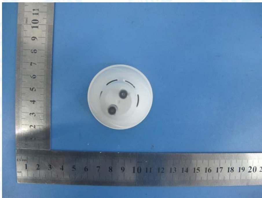
Photo 2 Appearance of EUT