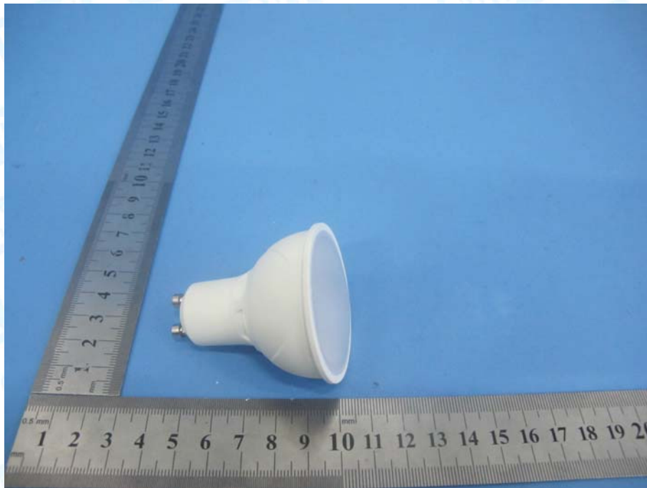
Photo 4 Appearance of EUT