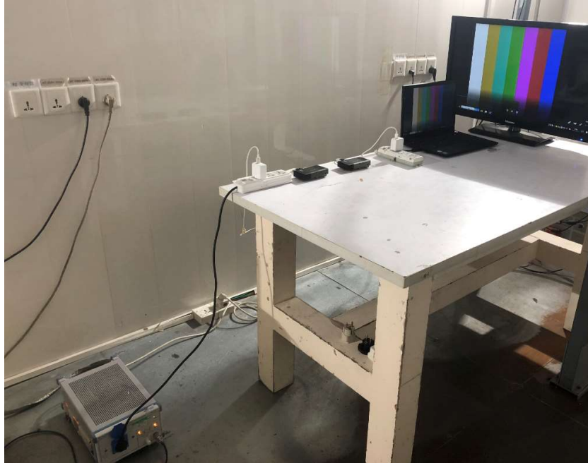
Transmitter Radiation Measurement below 1GHz