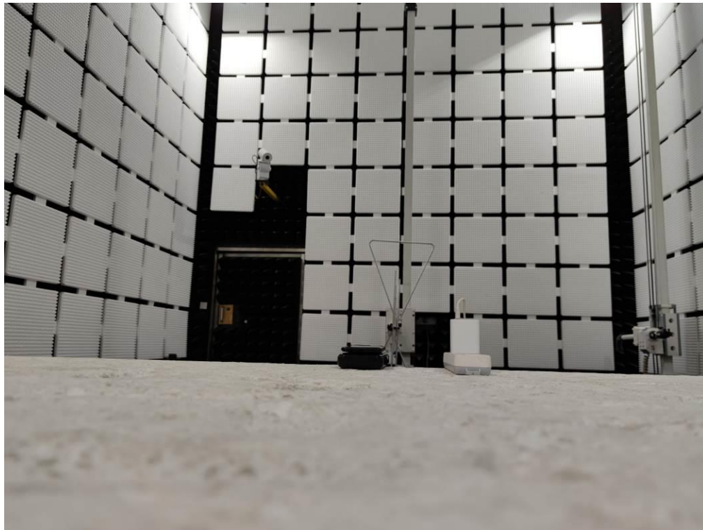
Radiated Emission Below 1 GHz