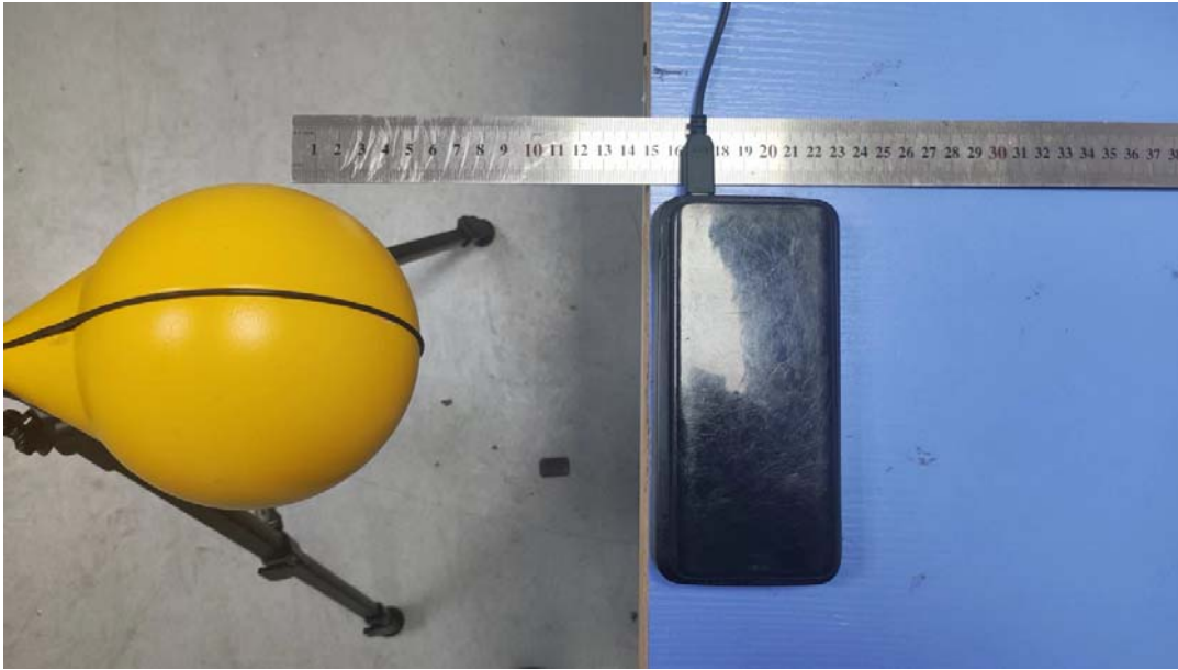
Test Position A-