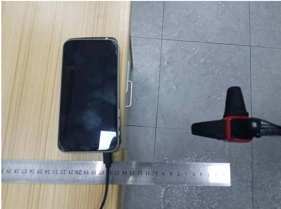
est Position B