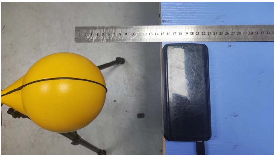
Test Position B