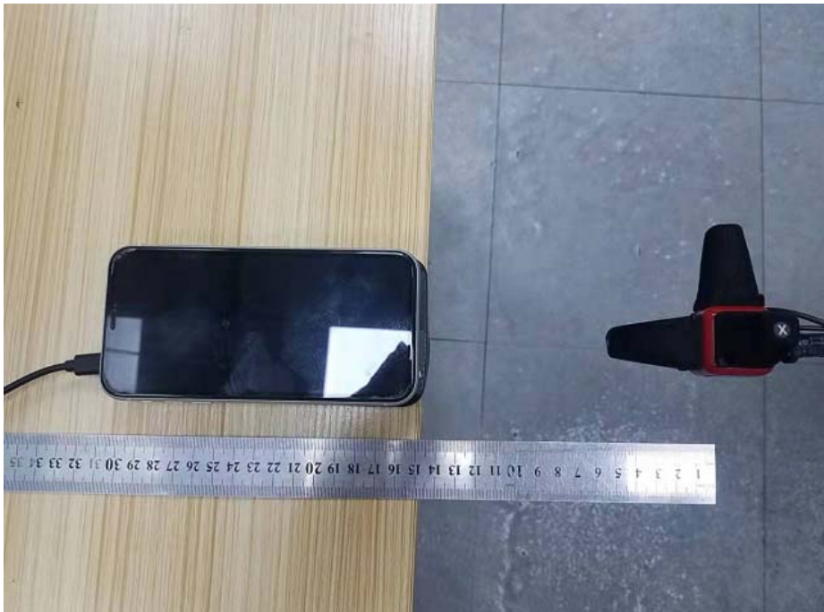
Test Position C