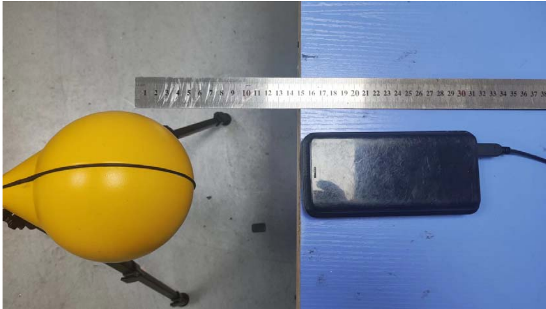
Test Position C