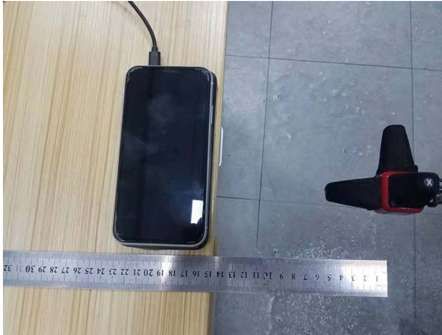
Test Position A-