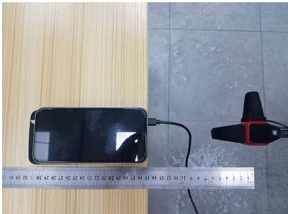
Test Position D