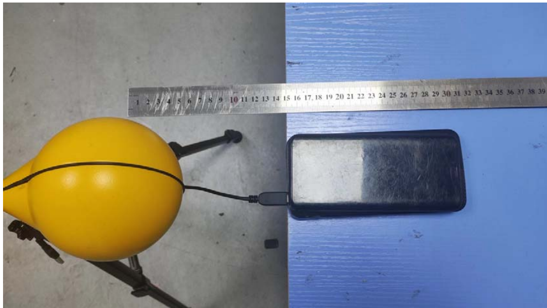
Test Position D