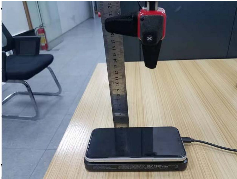
Test Position E