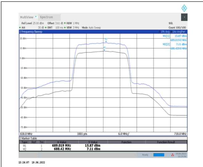
1-N71--15-20-H-1-DFT-256QAM-Outer_Full-100@0-Ant0-8.76-100%-0.00-8.76-PASS- \leq 13