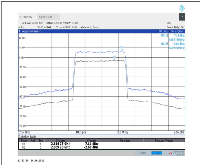
1-N38--30-40-H-1-DFT-256QAM-Outer_Full-100@0-Ant0-9.80-19.4%-7.12-2.68-PASS- \leq 13