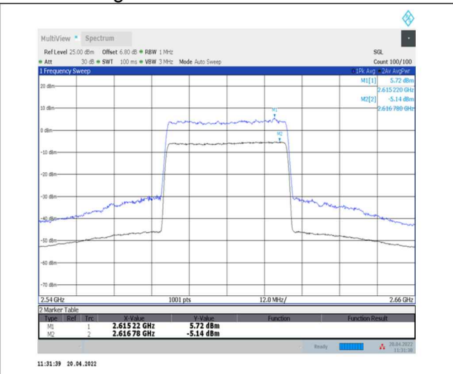
1-N38--30-40-H-2-CP-256QAM-Outer_Full-106@0-Ant0-10.86-19.4%-7.12-3.74-PASS- \leq 13