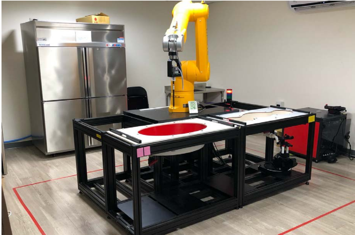
Liquid depth in the flat Phantom ( \geq 15\text{cm} depth) HSL(750MHz)