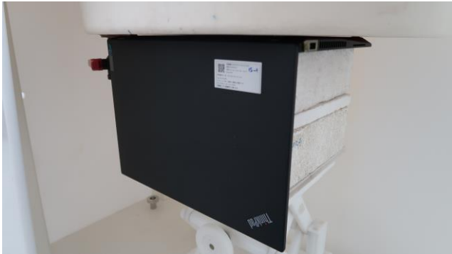
Bottom of Laptop at 0 mm