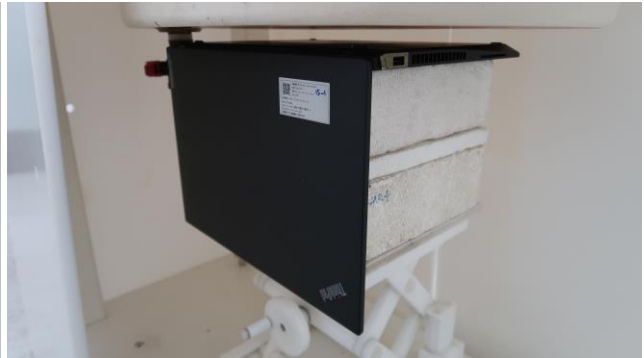
Bottom of Laptop at 11 mm