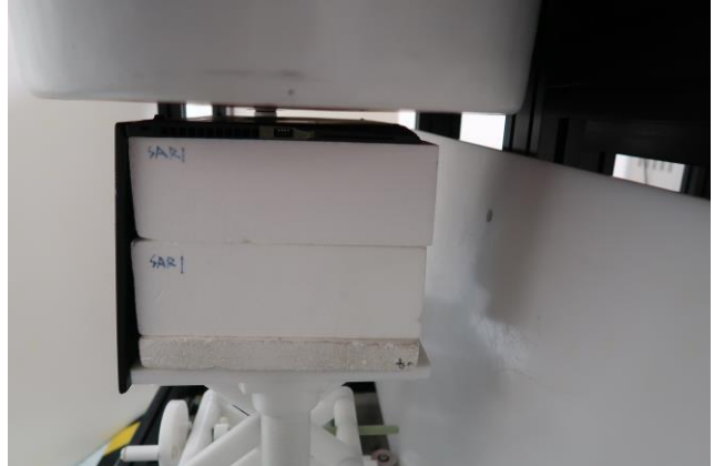
Bottom of Laptop, Test Separation 11 mm