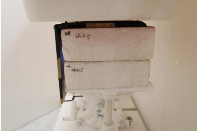
Bottom of Laptop, Test Separation 0 mm