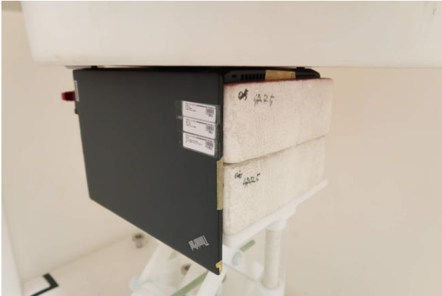
Bottom of Laptop, Test Separation 0 mm