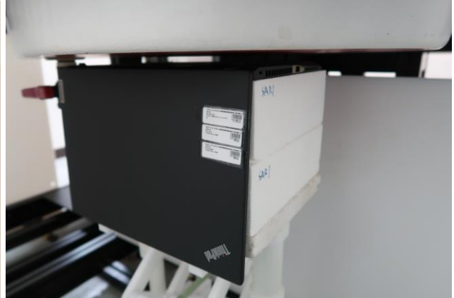
Bottom of Laptop, Test Separation 11 mm