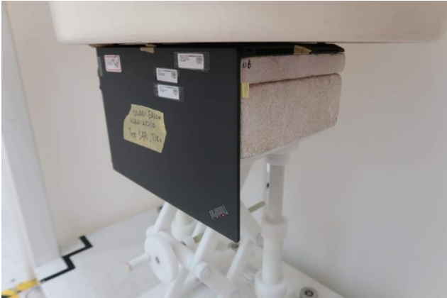
Bottom of Laptop, Test Separation 0 mm