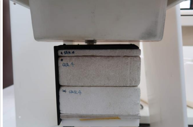
Bottom of Laptop, Test Separation 16 mm