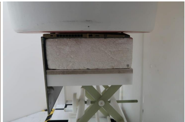
Bottom of Laptop, Test Separation 0 mm