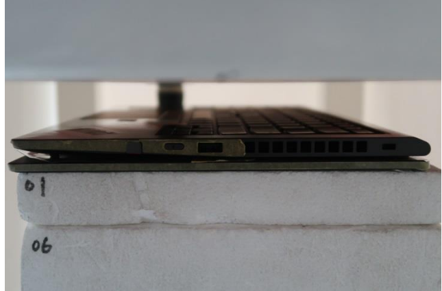
Bottom Face, Test Separation 30 mm