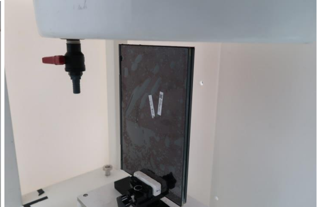
Edge4, Test Separation 10 mm