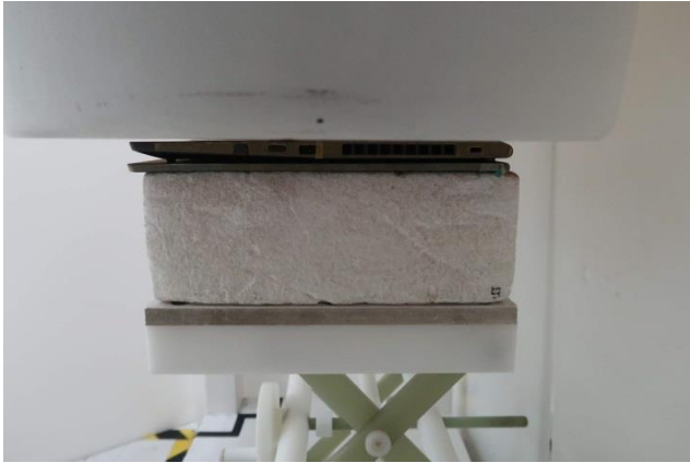
Bottom Face, Test Separation 0 mm