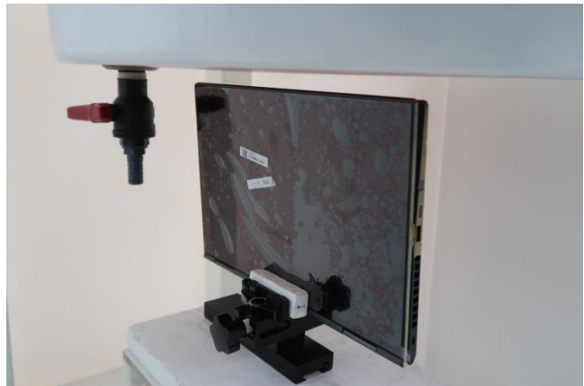
Edge1, Test Separation 6 mm