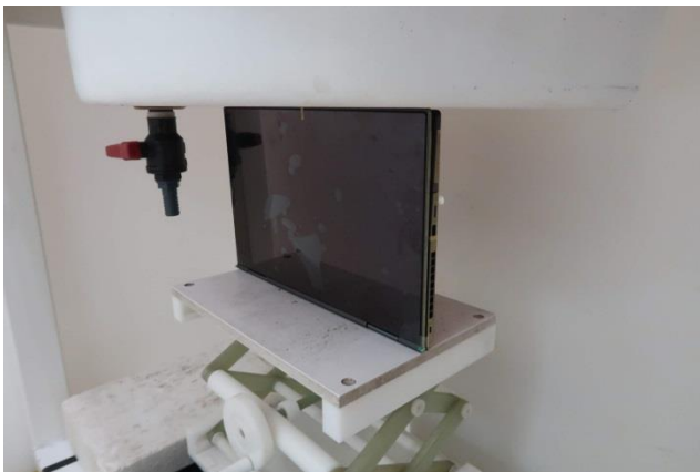
Edge1, Test Separation 0 mm