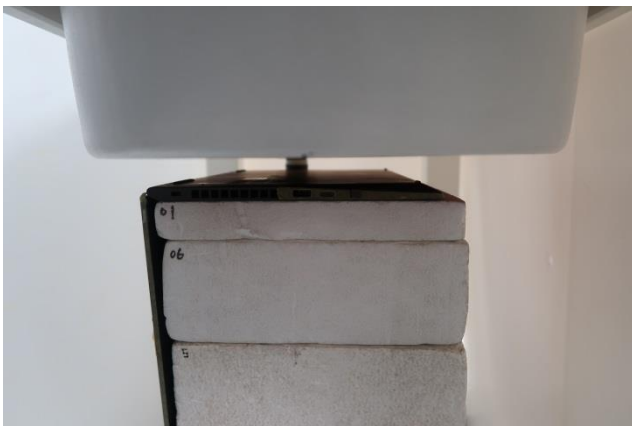
Bottom of Laptop, Test Separation 20 mm