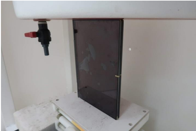
Edge4, Test Separation 0 mm