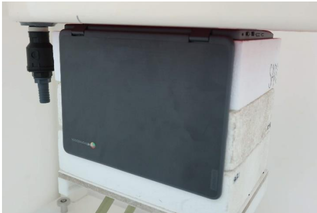
Bottom of Laptop 0 mm