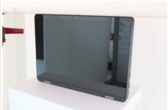
Edge1 at 0 mm