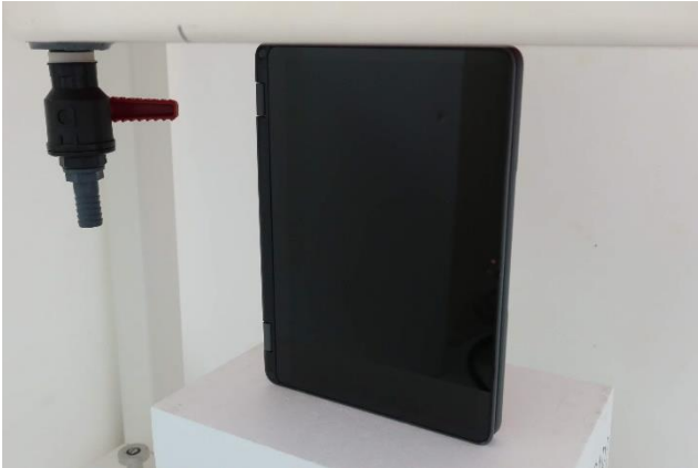
Edge4 at 0 mm