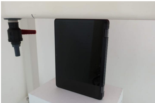
Edge2 at 0 mm