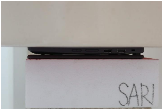
Bottom Face at 0 mm