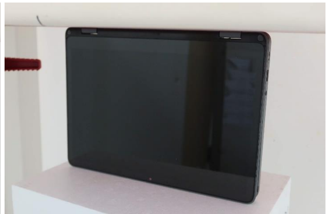
Edge3 at 0 mm