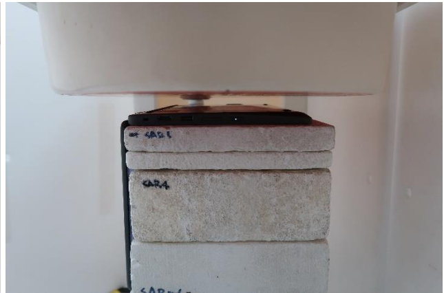
Bottom of Laptop at 14 mm