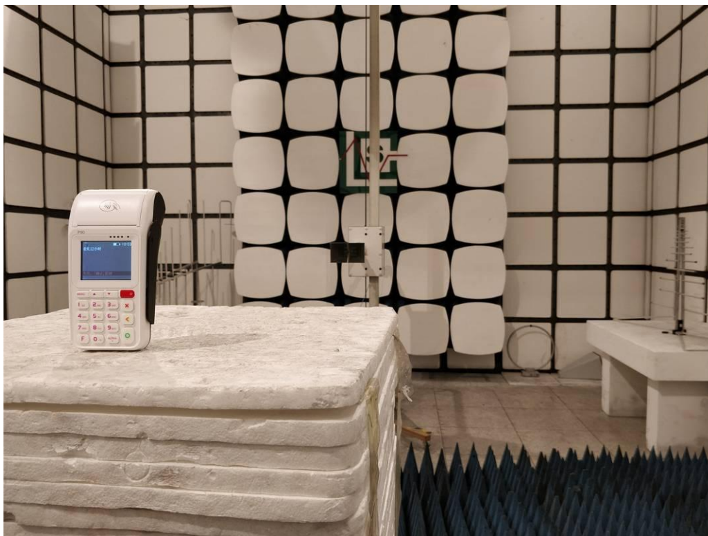
Fig. 2 (Above 1GHz)