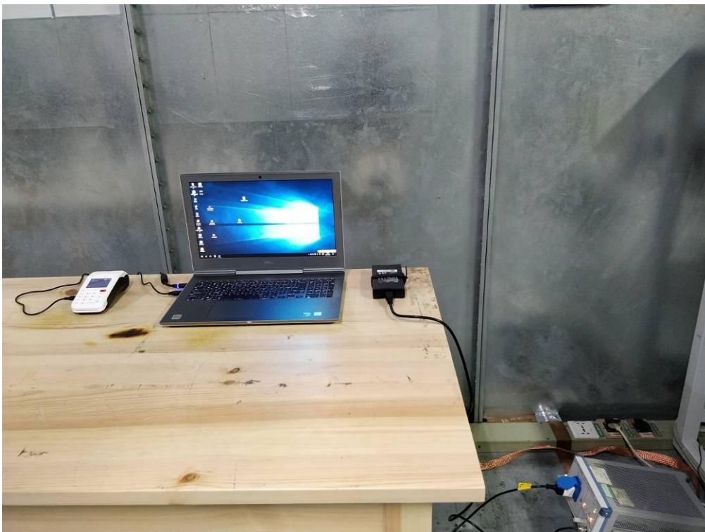
AC Conducted Emission of charge from PC mode