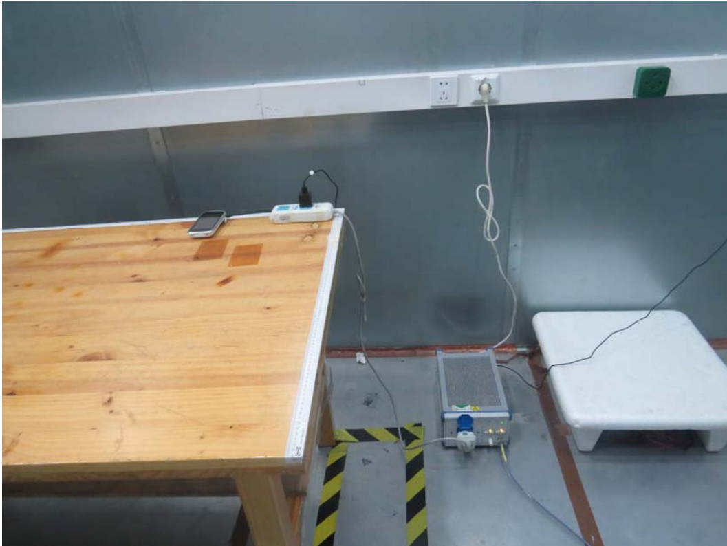
Picture 3 Conducted Emission Test Setup