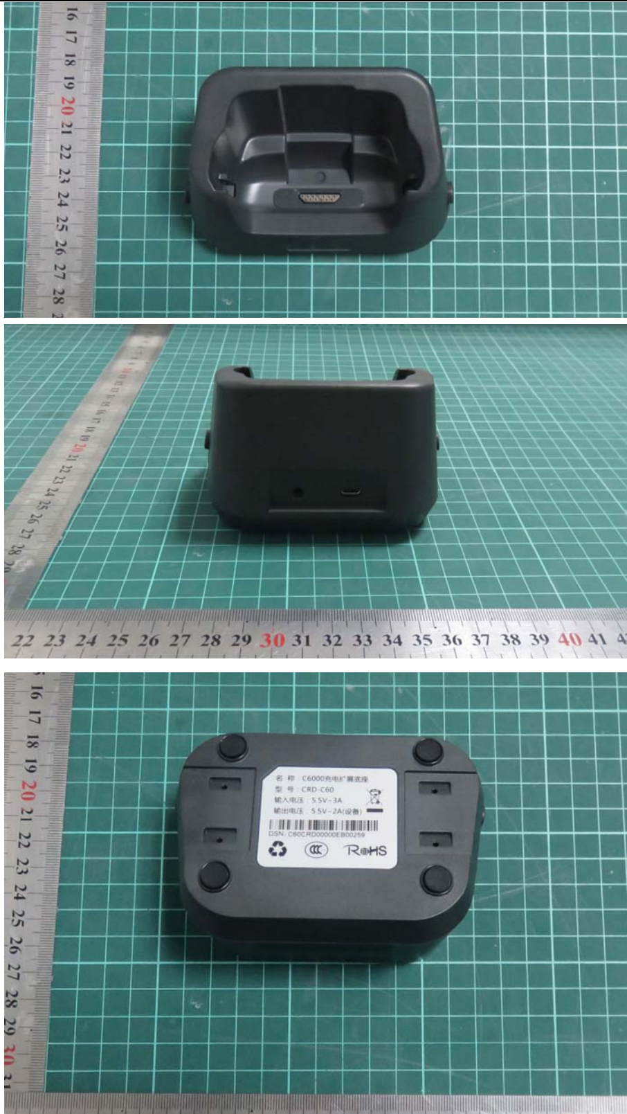
Charger pedestal holder C: Adapter Picture 1 EUT and Auxiliary