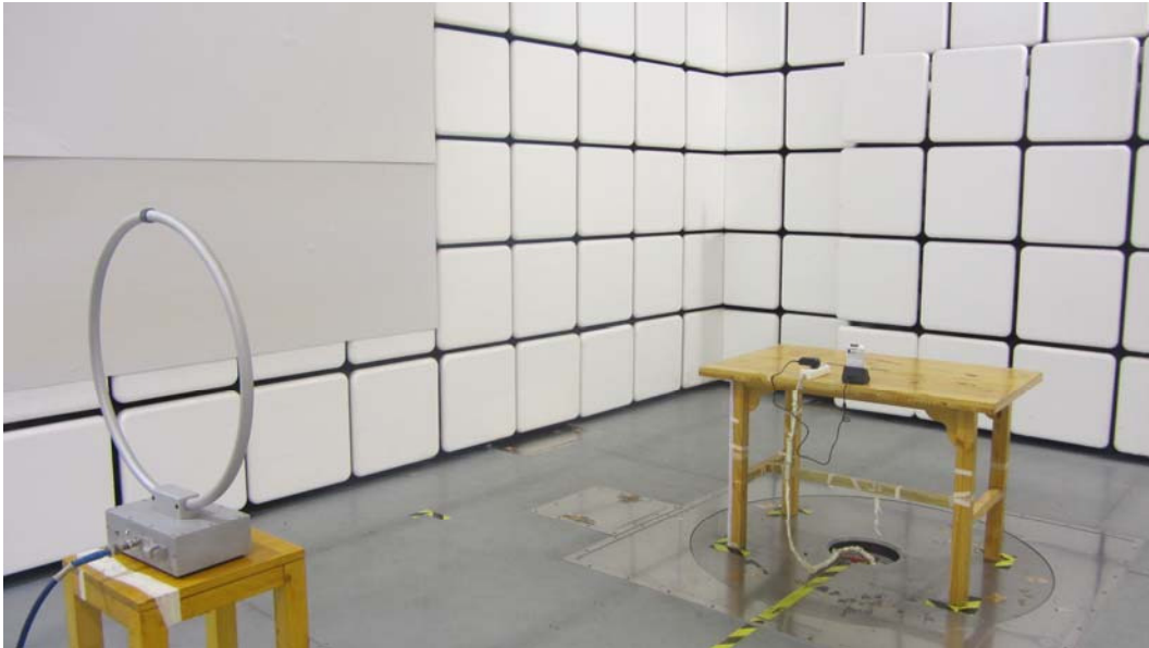
9kHz - 30MHz