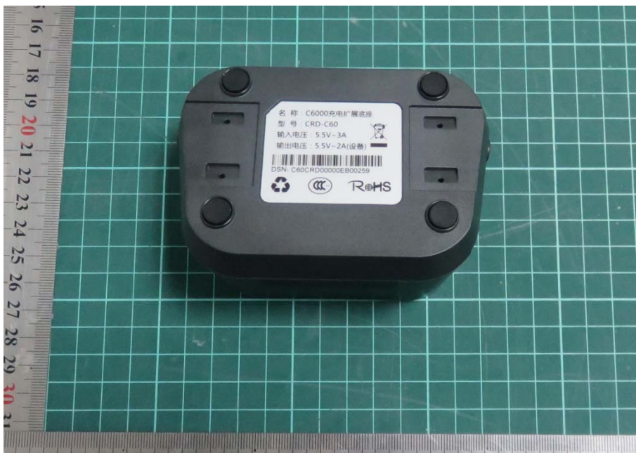
Charger pedestal holder