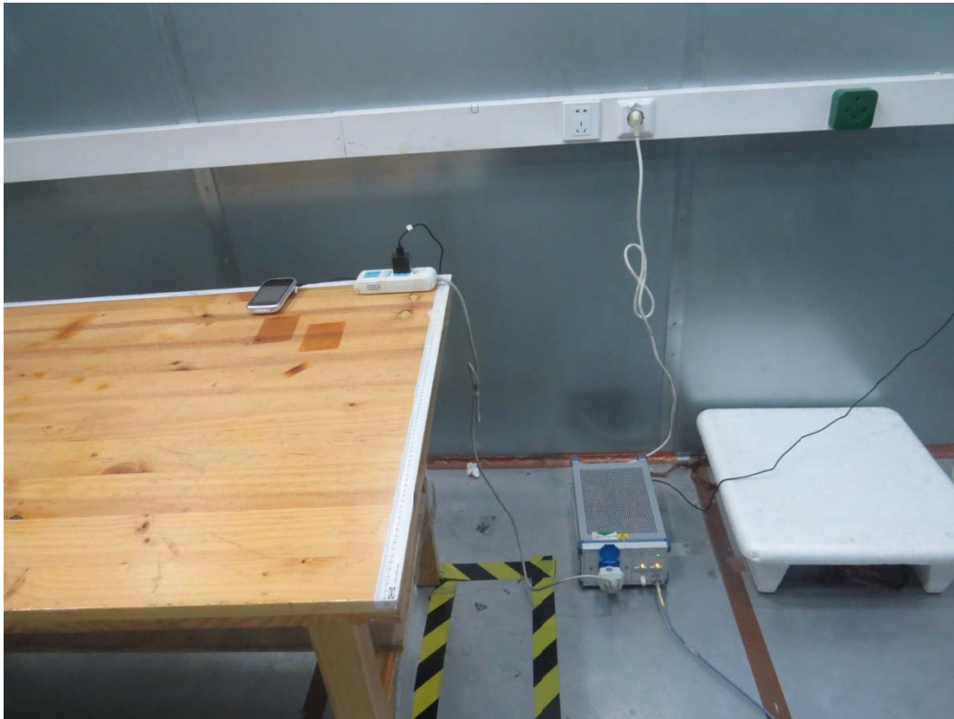
Picture 3 Conducted Emission Test Setup