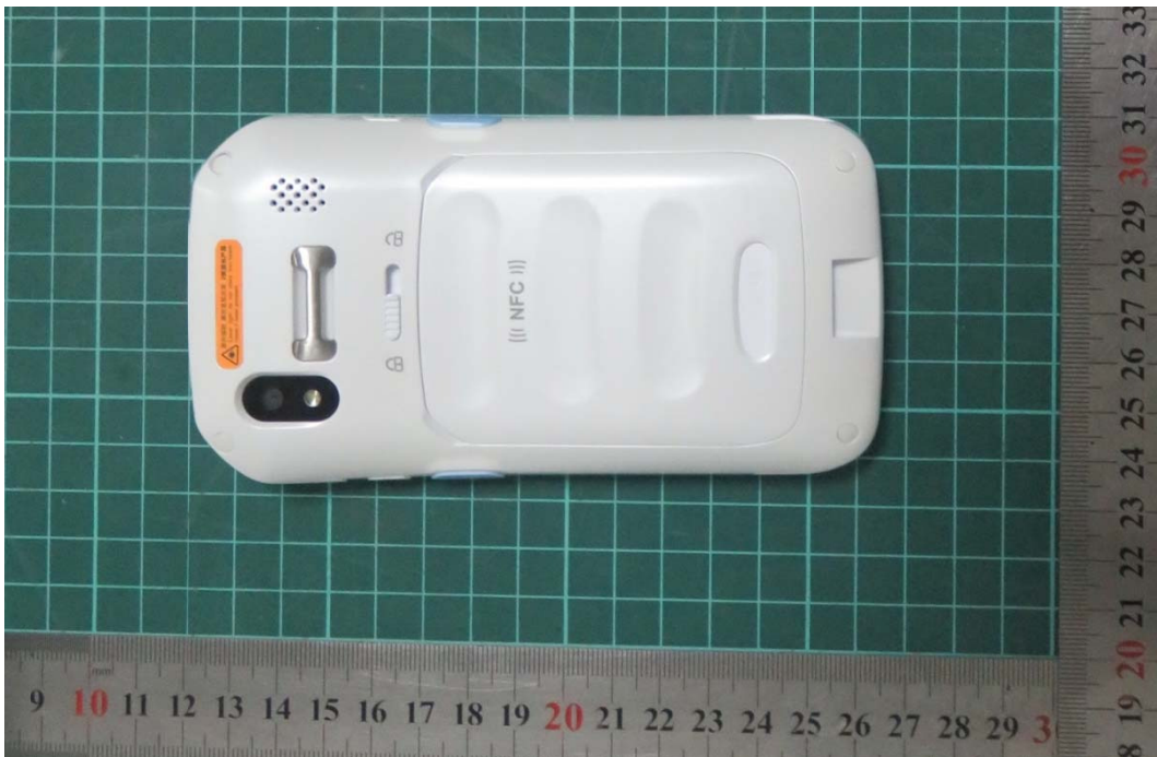
Back Side a: EUT