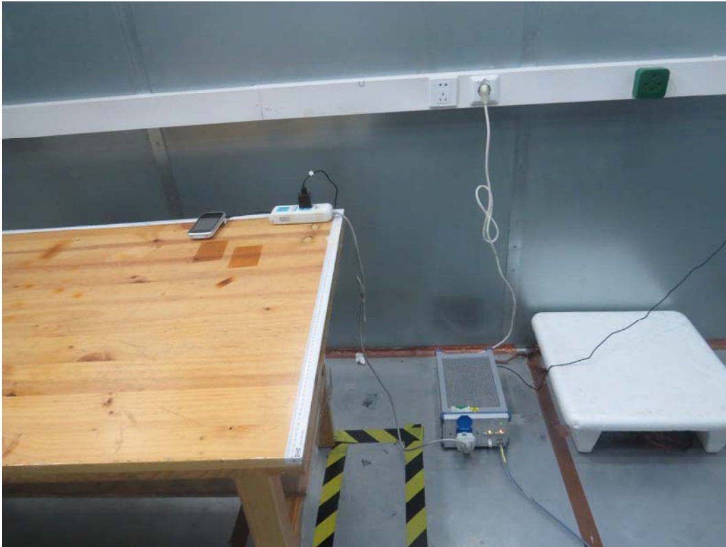
Picture 3 Conducted Emission Test Setup