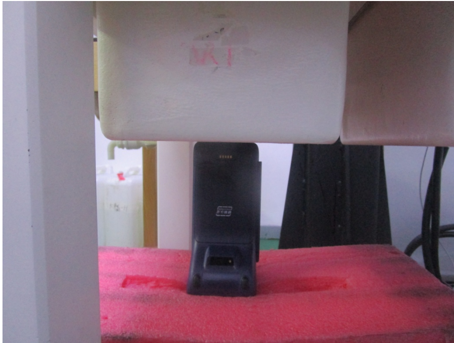
Handheld Top Setup Photo (0mm)