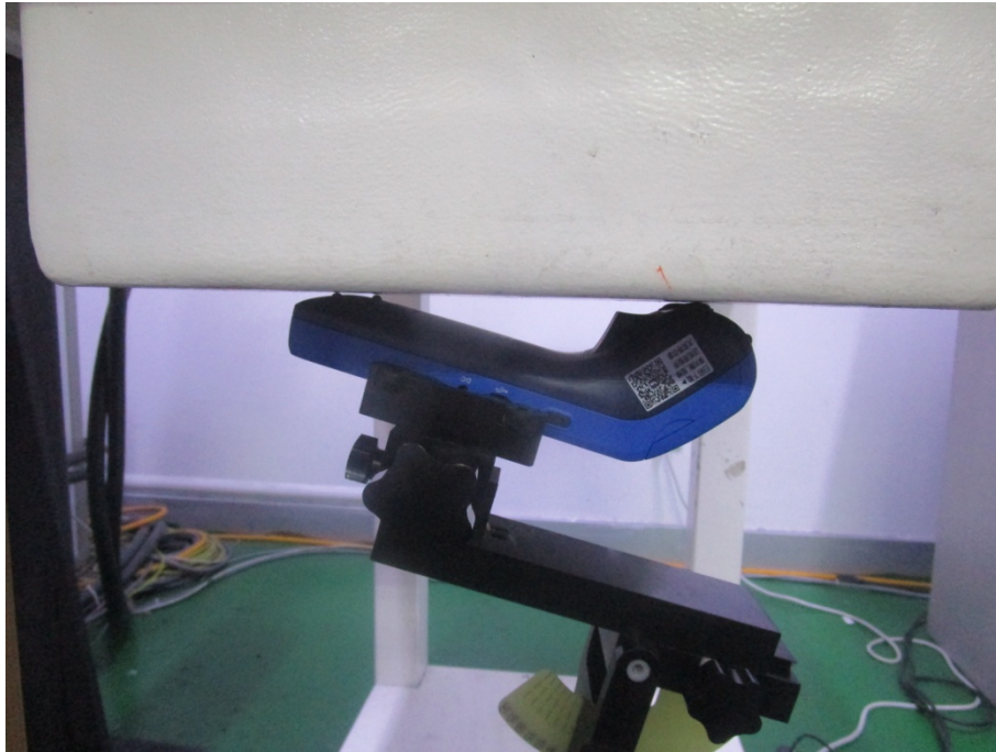
Handheld Back Setup Photo (0mm)