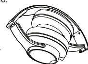
Fold to store in case