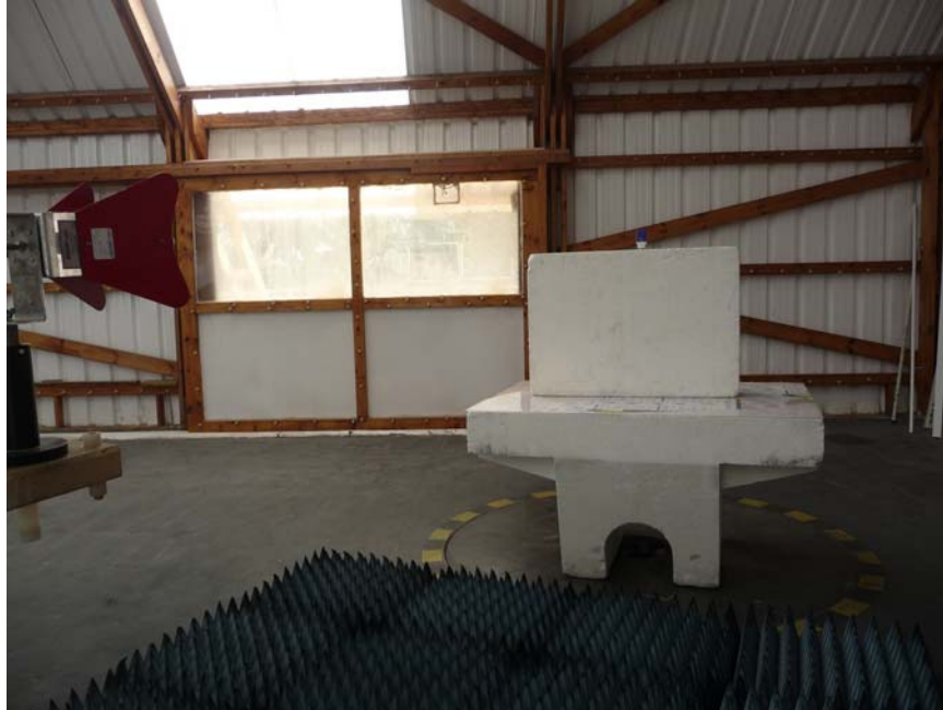
Photograph No.1 Carrier field strength measurement setup